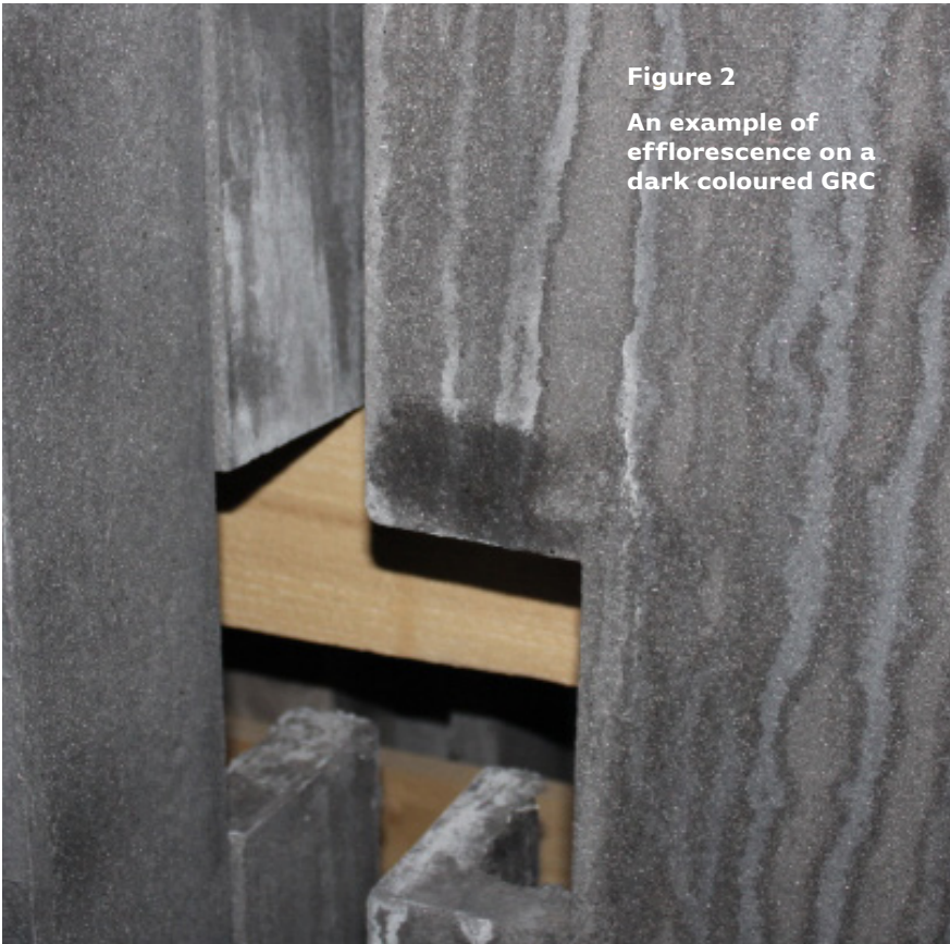
Figure 2 An example of efflorescence on a dark coloured GRC

Surface crazing does not affect the structural integrity of the unit however if in any doubt professional advice should be sought.